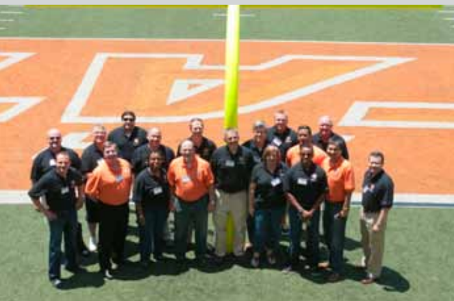
The first class tours Boone Pickens Stadium on their visit to Stillwater.

The 19 members of the Ph.D. in Business for Executives program (2012–2014 cohort) traveled to Oklahoma State University's main campus in Stillwater to attend classes on Friday, June 29. After meeting at OSU-Tulsa monthly since January, the trip to Stillwater was a new experience for the group, especially for nearly half of the participants who reside outside of Oklahoma.