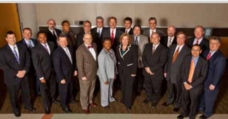
Members of the inaugural class of the Ph.D. in Business for Executives.

This year brought Oklahoma State University a chance to take another step towards distinguishing itself as a place for true innovation and leadership. In January, OSU's Spears School of Business began the Ph.D. in Business for Executives program—one of the few AACSB-accredited doctoral programs targeted at executives in the United States. The program structure requires the students to meet monthly for three days—Thursday, Friday and Saturday—as well as between sessions to connect with professors through conferencing technologies and online platforms.