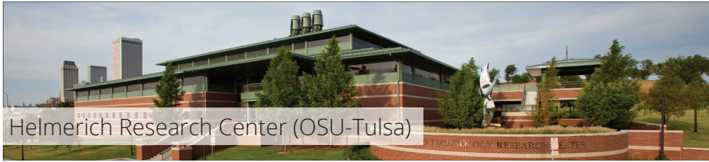
Helmerich Research Center (OSU-Tulsa)