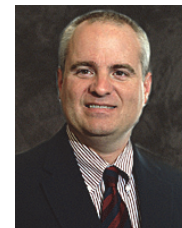
Tom Brown Noble Foundation Chair in Marketing Strategy and Professor