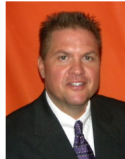
James Mason Clinical Professor