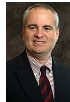
Tom Brown Noble Foundation Chair in Marketing Strategy and Professor