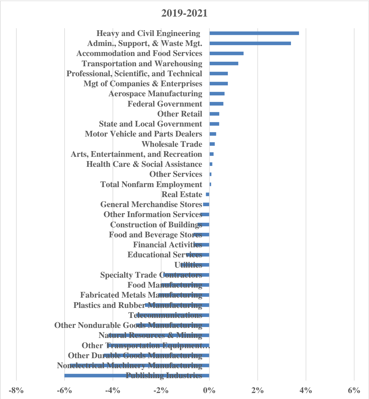
Figure 3: 2019-2021 Oklahoma Employment Growth (Annualized %)