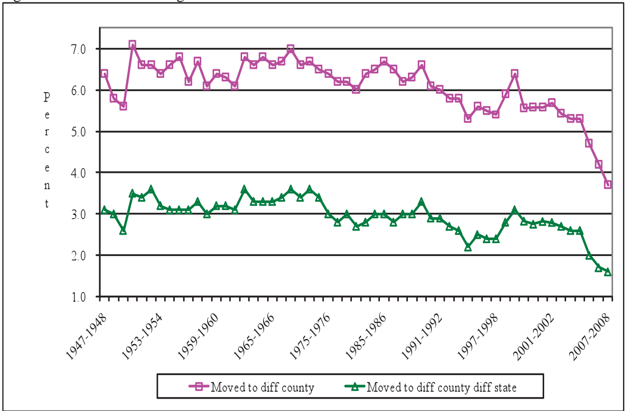
Figure 1. Annual Gross Migration Rates: 1947-2008.

Source: U.S. Census Bureau, Current Population Survey, Table A-1. Annual Geographical Mobility Rates, By Type of Movement: 1947-2009, available at: http://www.census.gov/population/socdemo/migration/tab-a-1.pdf (accessed Sept. 13, 2010).